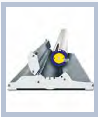
The image is well protected during transportation.

Roll Up Classic has been named a "work of applied art" by the Swedish Society of Craft and Design. The system is easy to transport and assembles in a flash for your presentation. Roll Up Classic is available in a wide range of widths and is ideal for repeated use in different environments.