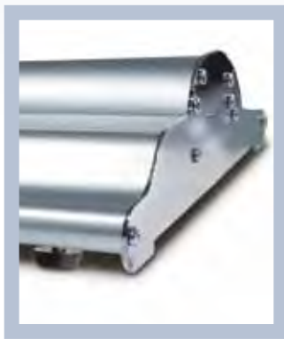
A stable design with feet that compensate for uneven surfaces.